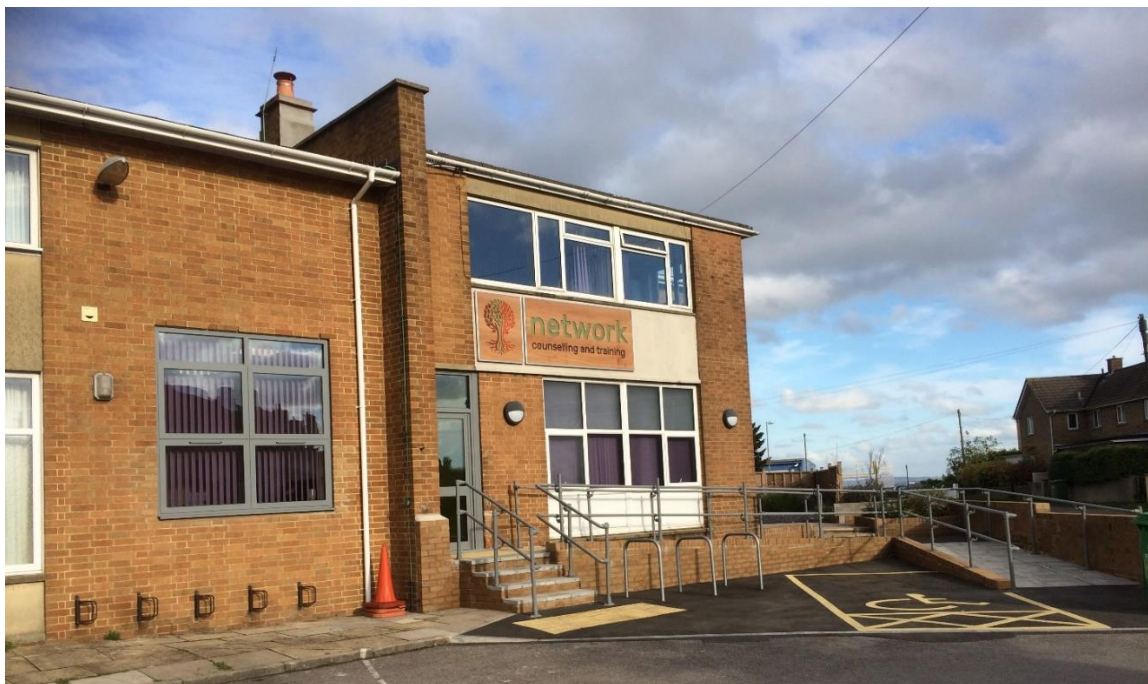
Network at Elm Park, Filton

We are very proud of the quality and professionalism of our training programme and hope that you will choose to undertake your Counselling Certificate training with us. This prospectus is intended to give you the information you need to help you make that decision. If there is anything else you would like to know – or if you would simply appreciate the opportunity to meet with someone from the Training Team to talk things through – we would love to hear from you.