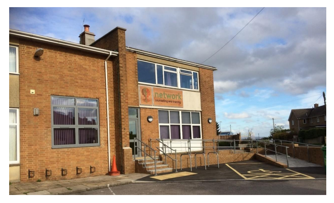
Network at Elm Park, Filton

We are very proud of the quality and professionalism of our training programme and hope that you will choose to undertake your Counselling Diploma training with us. This prospectus is intended to give you the information you need to help you make that decision. If there is anything else you would like to know – or if you would simply appreciate the opportunity to meet with someone from the Training Team to talk things through – we would love to hear from you.