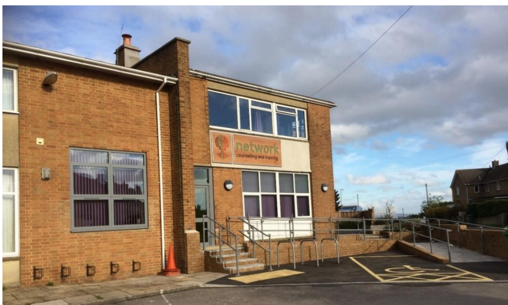
Network at Elm Park, Filton

We are very proud of the quality and professionalism of our training programme and hope that you will choose to undertake your counselling training with us. This Prospectus, and the accompanying Course Information Book, is intended to give you the information you need to help you make that decision. If there is anything else you would like to know – or if you would simply appreciate the opportunity to meet with someone from the Training Team to talk things through – we would love to hear from you.